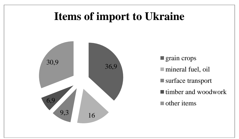
Figure 3. Structure of import of goods to Ukraine from Romania in 2015

Activity of Ukraine Cultural and Information Centre in Bucharest is priority. It's directed towards the forming of Ukraine's affirmative image, expansion of information about Ukraine, providing with interests of our country in Romaine relations. Realization of wide range actions, in particularly concerning assistance of progress of partnership between Ukraine and Romania in sphere of culture, education, science, tourism and sport, expansion information about Ukraine between Romaine community, familiarization with Ukraine's culture and history etc.